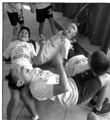
Sixth Graders enjoyed their retreat last week. Students look forward to the engaging experiences, where they focus on exploring and developing their faith.