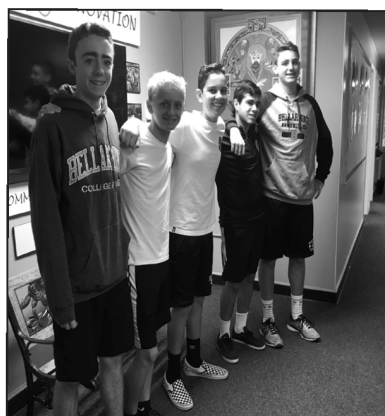
St. Lucy School graduates now attending Bellarmine spent a day of service on our campus. It was wonderful to welcome them back!

ADVANCE PRICING LAST DAY: WED, OCT 4TH www.stlucyschool.org