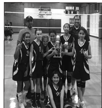
SLS 6th grade girl volleyball players placed third in their first home tournament of the season in the St. Lucy Gymnasium. "Go Lightning!"