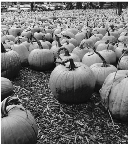
Kindergarten studies pumpkins at Uesugi Farms.