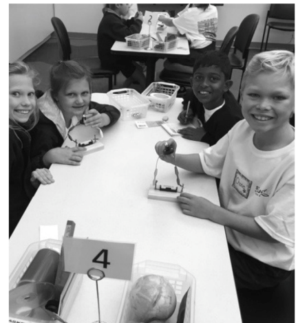
3rd Grade studies magnetism at the Tech Museum.