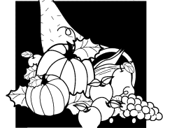
Día de Acción de Gracias

La Misa de Acción de Gracias será el 23 de Noviembre, 2017 a las 9AM. Podrán traer alimentos para ser bendecidos durante la misa. Una Oración de Acción de Gracias aparecerá en el boletín de Nov. 18-19, 2017 para la puedan usar durante su cena de Acción de Gracias.