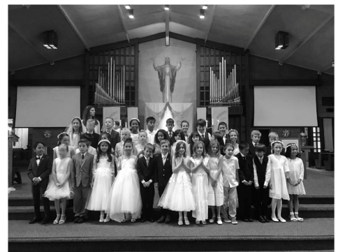
God bless our 2nd Graders

www.stlucyschool.org admissions@stlucyschool.org or (408) 871-8023