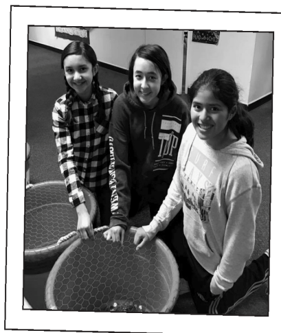
The Annual Penny Challenge is a spirited way to raise money for our school charities.