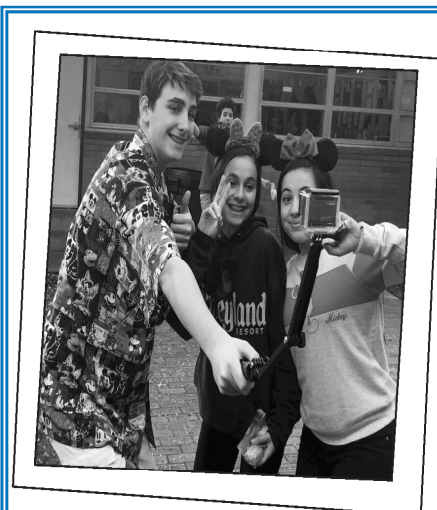
Student Council kicked off Spirit Week celebrations with Travel Day. School Spirit runs high at SLS!

St. Lucy School NOW ENROLLING (408) 871-8023 admissions@stlucyschool.org www.stlucyschool.org