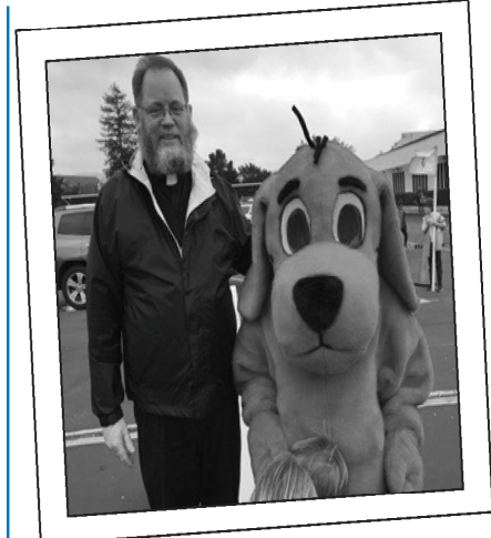
The Scholastic Book Faire is this week! Students love the visits from Clifford, the Big Red Dog.