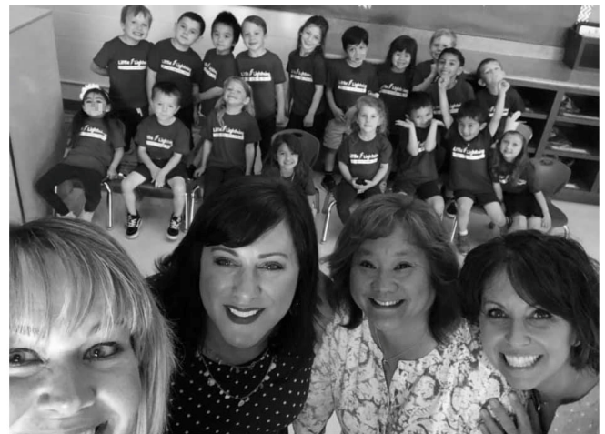
Pre-K Class of 2028

Congratulations to all of our 2019 St. Lucy School graduates!