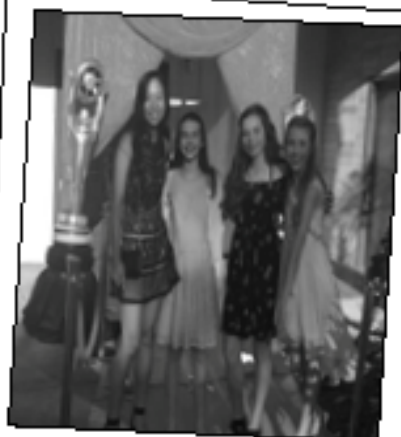
8th grade parents decorated for a Hollywood themed 8th grade dance.

admissions@stlucyschool.org www.stlucyschool.org