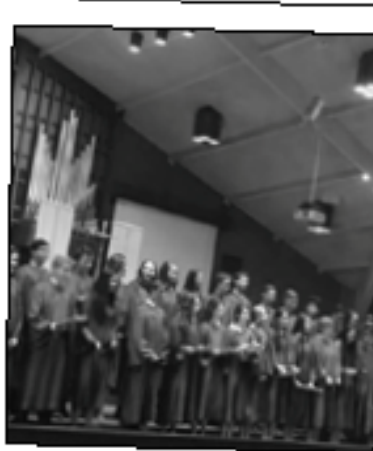
We are so proud of our St. Lucy School graduates!