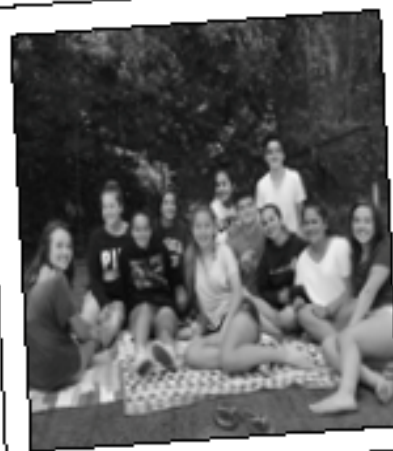
8th graders loved relaxing and celebrating friendships at the class picnic.