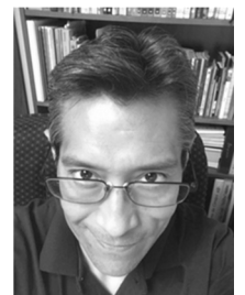
Pastoral Associate, Spanish / Asociado Pastoral, Español