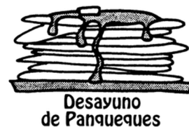
Desayuno de Panqueques