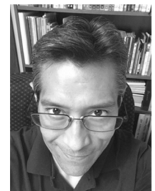
Pastoral Associate, Spanish / Asociado Pastoral, Español