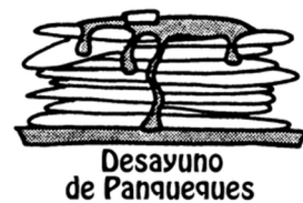
Desayuno de Panqueques

Los boletos también estarán disponibles en la puerta. El precio del boleto es de $7 para adultos y $4 para niños menores de 12 años. El desayuno se llevará a cabo el 19 de febrero entre las 8AM y la 1PM. Como de costumbre, los ingresos son para financiar el transporte de la Caminata por la Vida en San Francisco en 2018.