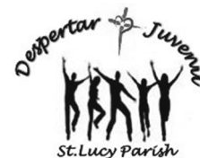
St. Lucy Parish

¿Estás cansado de la rutina? ¿Eres un joven entre 18 y 35 años de edad? ¿Quieres conocer más de tu fe? El grupo de Jóvenes Adultos Despertar Juvenil te invitan este y todos los viernes a compartir un momento de oración, dinámicas, y temas interesantes en un ambiente juvenil. ¡Te esperamos este viernes a las 7:30 pm en el salon lally! Para más información te puedes comunicar con Aida al 408-469-6493 o con Jaime al 408-780-6764.