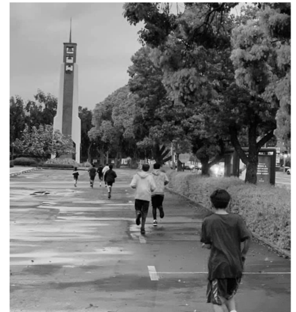
Dedicate student athletes prep for the annual Track Meet!