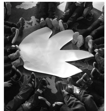
How many Pre-K feet fit within a triceratops footprint?