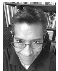
Pastoral Associate, Spanish / Asociado Pastoral, Español