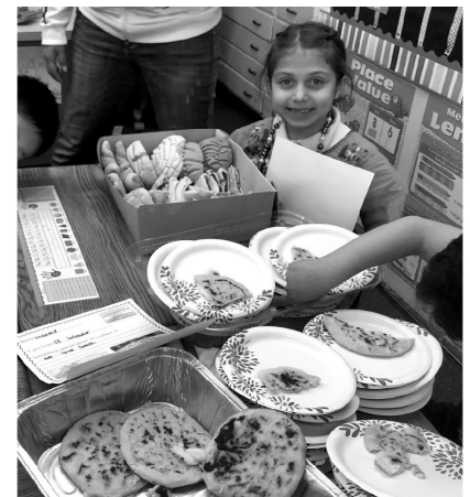
1st graders love to share their heritage on Cultural Day!